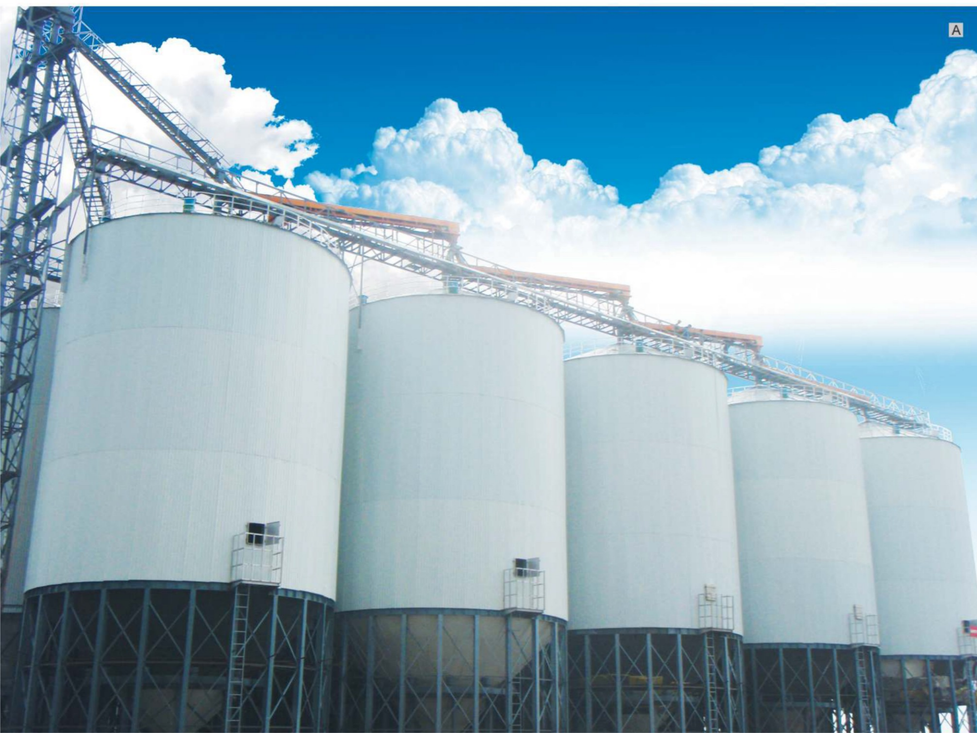
A 缅甸MEC公司 MEC in Burma