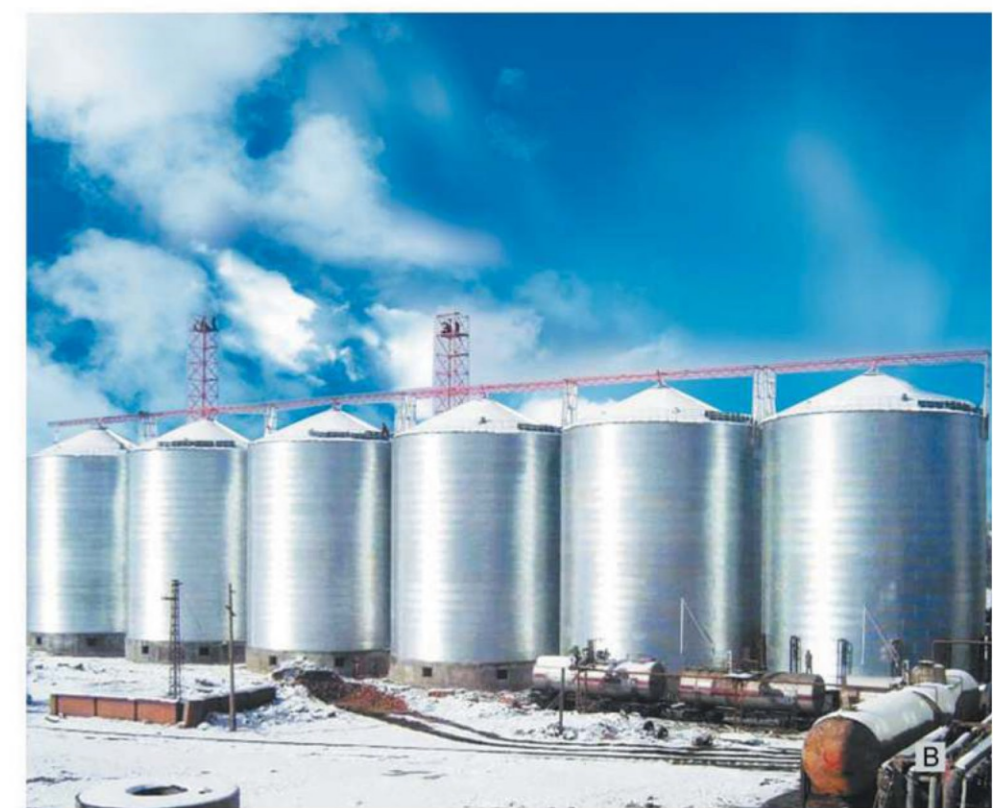
C 柬埔寨稻谷仓 Project in Cambodia