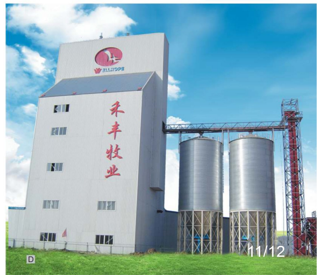
A 广东凤凰饲料有限公司 Guangdong Phoenix Feed Co.,Ltd.